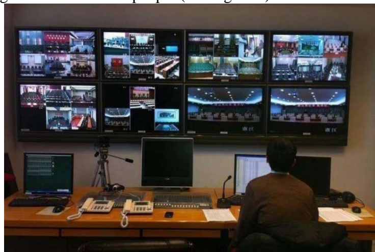
Fig.3 Intelligent Security Monitoring

At present, the monitoring system has been widely used in various fields of urban life, and it has played a very important role for the public security departments to collect information and assist in solving crimes. However, in the face of so many surveillance videos, it is impossible to achieve high-efficiency work level simply by manpower, and the application of AI has solved this problem well. How to effectively use increasingly complex information and data to improve the utilization rate of monitoring information and data is an urgent problem to be solved in the process of construction and growth of today's intelligent cities. Deploy electronic police in key places and entrances and exits of cities, conduct real-time video structured analysis of vehicles and people entering key places through biometric identification and deep learning technology, and give real-time alarm to dangerous vehicles and people (see Figure 3).