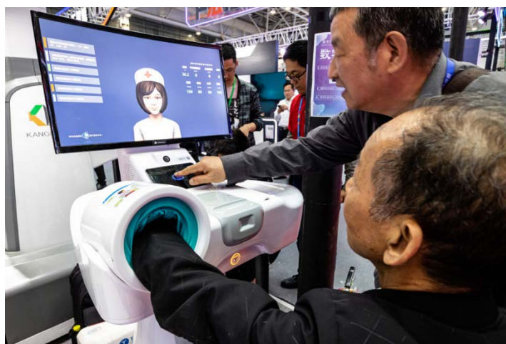
Fig.1 Intelligent Medical Diagnosis System

Medical institutions can use a variety of intelligent medical devices to remotely diagnose, visit and treat patients[9]. Intelligent alarm device is the most widely used AI in medical and health care industry, which can prevent the deterioration of the disease and get effective assistance in time. Intelligent technology can accurately analyze the patient's condition and provide doctors with accurate treatment directions.